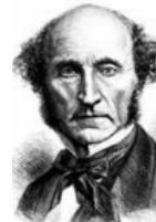
John Stuart Mill